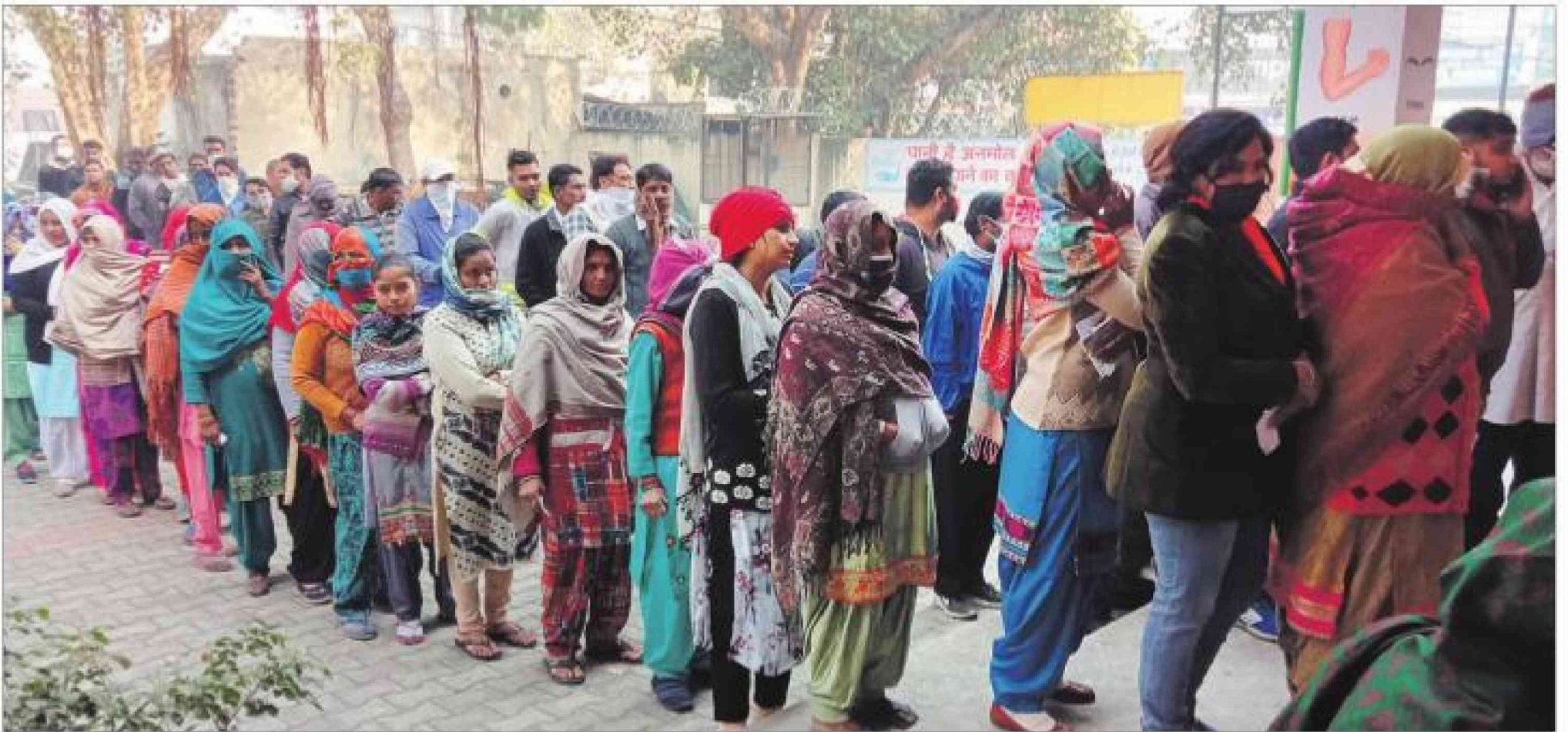
Voters queue up to exercise their franchise at a polling station in Sonapat on Sunday.