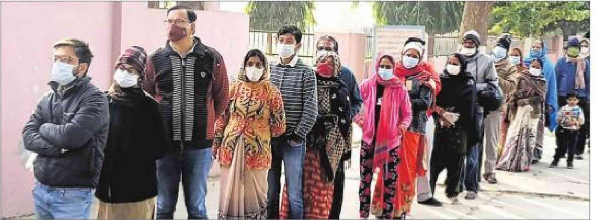
Electors wait for their turn at a polling booth in Rewari on Sunday.